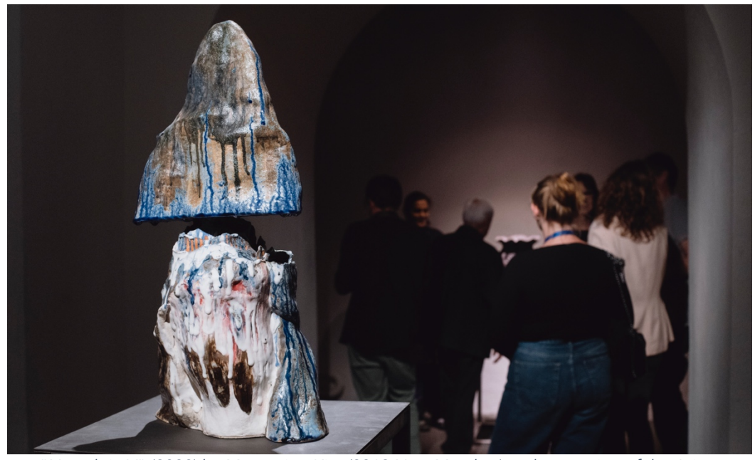
"Nostalgie V" (2020) by Myung-joo Kim (2019 New Member) at the opening of the Ariana Museum exhibition "MIGRATION(S)" on Day 1 of the 2022 Geneva Congress.

Académie Internationale de la Céramique International Academy of Ceramics